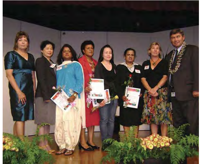
A 2010 North Shore Mayoral Graduation

Industry training graduations are an initiative of the Mayors' Taskforce for Jobs and are organised by local councils. They are a great way for the community to celebrate the successes of trainees, and also the value that organisations place on training and workforce development.